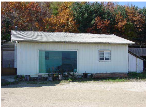
The Steel House