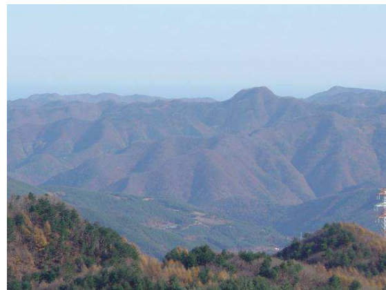
One of Our Views (See the ocean!)

We moved into our “Steel House” built of two shipping containers bolted together side by side. It has oil-supplemented coal (Korean “yontan”) heated floors and just enough room for us to relax, almost like a honeymoon cottage. It’s been almost thirty years since it was just the two of us and, while we love all our kids and extended family dearly, we are truly enjoying being alone in our new home.